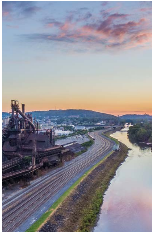
The sun sets over the Lehigh River in South Bethlehem.