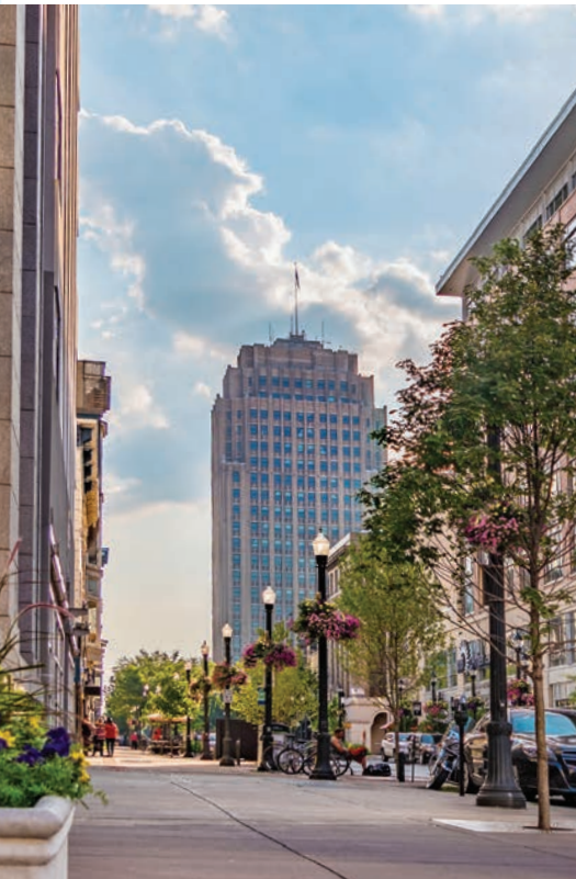
Residents enjoy an evening out in downtown Allentown.