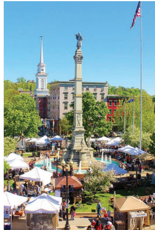
Shoppers gather at the Easton Farmers' Market.